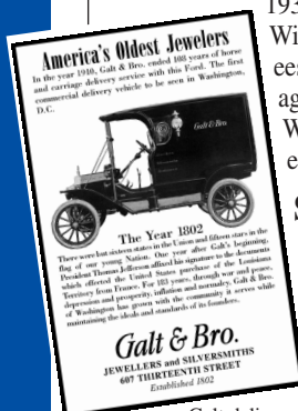
Galt delivery van in 1902