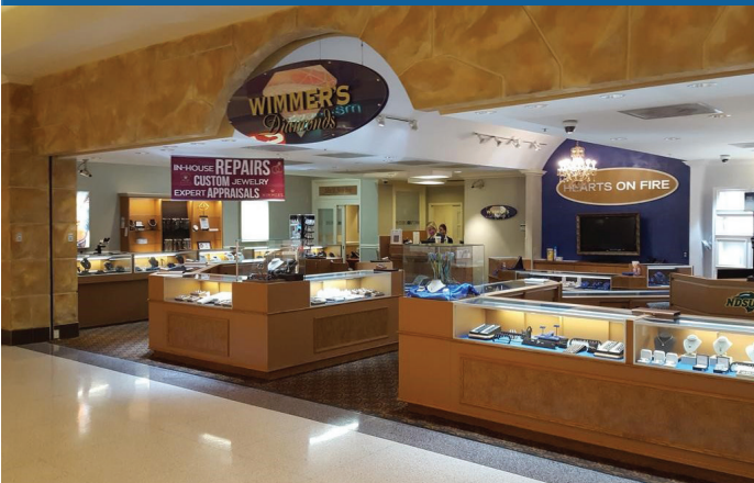
West Acres Location

The Experts in Going Out of Business. Retiring. Moving.