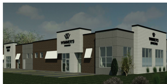
New Location Rendering